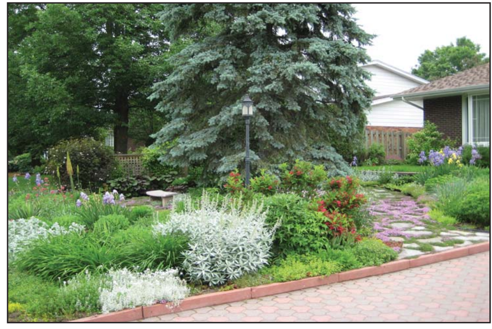
Figure 2 Xeriscape design