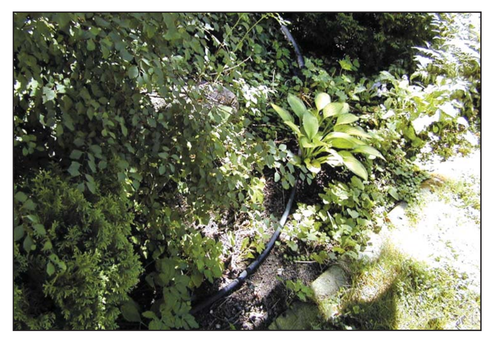
Figure I Soaker hoses have tiny pores that emit water slowly and directly to the soil. Place them at the base of plants on the ground.